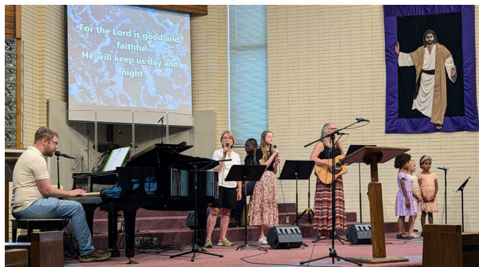
Thursday’s Youth Service featuring the youth in a number of ways

We accept donations by cash or cheque, as well as e-transfers to mclvor@mclvorchurch.com or via credit card on www.mclvorchurch.com . To arrange a gift via Direct Deposit, please contact the office.