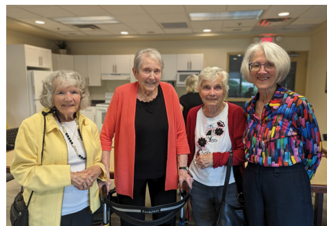
A wonderful visit!