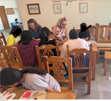
Right: crafts made by the children