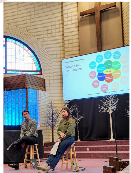
Above: conversations about our MB Confession of Faith in Adult Education