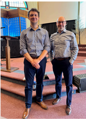
Right: our newest worship team