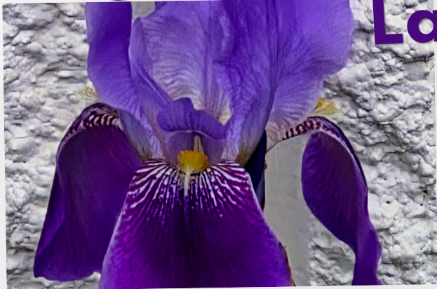
The first Iris at the church to bloom!